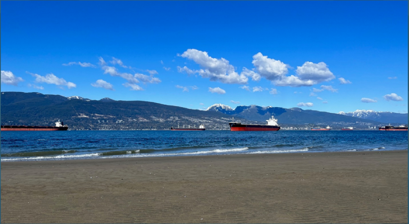
at Spanish Banks

CUISA headquarters are based in North Vancouver, seen here from low tide at Spanish Banks. Submit a scenic shot to exec@cuisa.com from your community for the next edition of CQ!